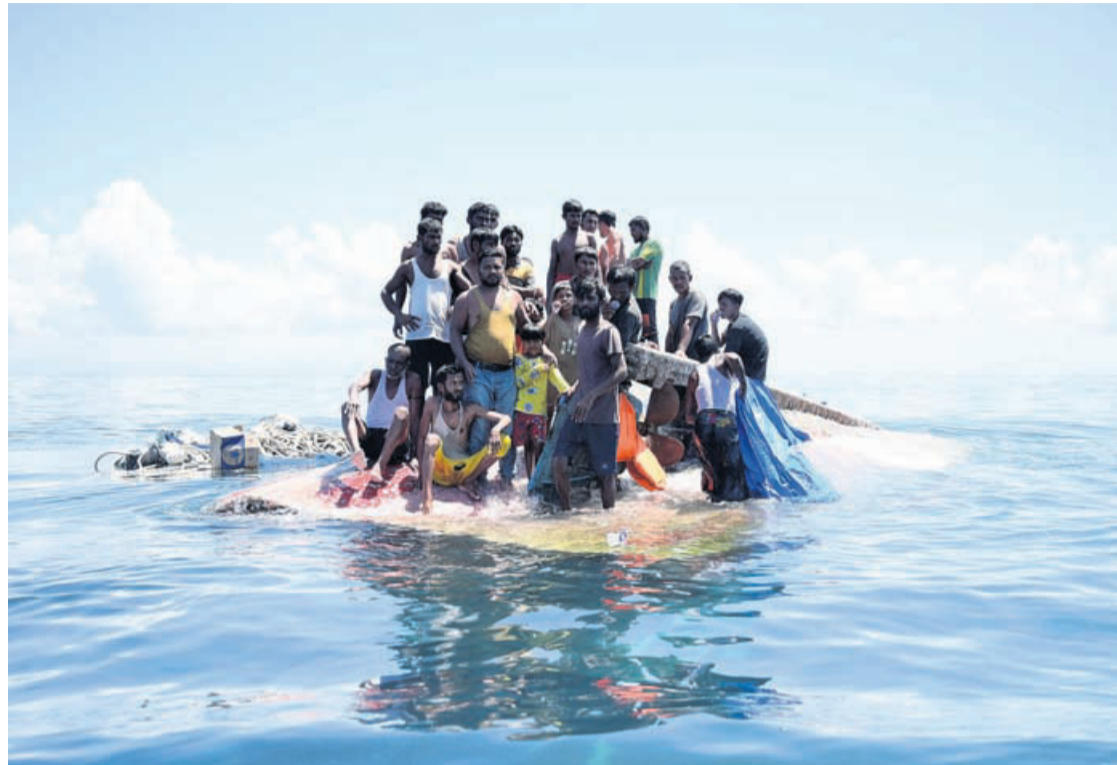
Rohingya refugees stand on their capsized boat before being rescued in the waters off West Aceh, Indonesia, Thursday, March 21, 2024.

There were contradictory reports about whether anyone had died in the accident, with survivors saying many who had been aboard when the boat departed from Bangladesh were still unaccounted for, but authorities insisted everyone had been rescued. "We have examined all 69 Rohingya that we rescued and from our examina-